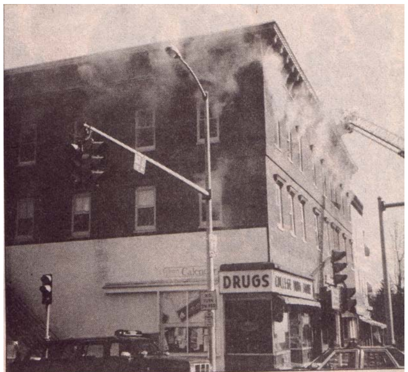
Smoke pours from the building on the northeast corner of the main intersection in downtown Amherst Saturday